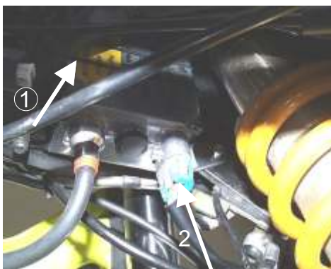
Steering Head from inside (Photo 2)

1. Mounting the ballast bracket. Loosen the 13mm nut holding the horn bracket to steering head. Pivot the horn towards the left side of the bike. Cut off and discard the cable tie from the right hand side of the steering head. Notice this hole is used for the mounting bracket. On USA models, the upper mounting hole may be covered by a GVWR sticker (2). Slide the ballast bracket in the tight spot between the front shock absorber and the right hand side of the steering head, with the tab at the bottom rear. Secure the bracket using the M5x25 dome headed allen screw in the center hole, from the inside of the steering head, and a large M5 washer and domed nut (the screw is not very long so tighten it well). Use the M5x20 allen head screw in the other hole, with a large M5 washer and domed nut. Supplied small triangular aluminium plate is not used in this application.