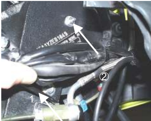
Steering Head from outside (Photo 1)

NOTE: Turn off the ignition before attempting any installation!