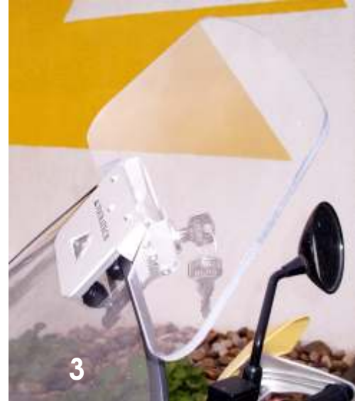
Photographed spoilers may vary from actual spoiler design