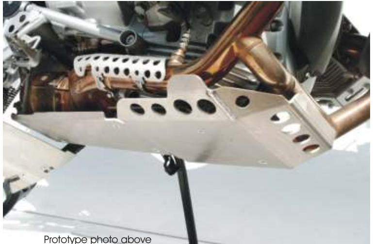
Prototype photo above