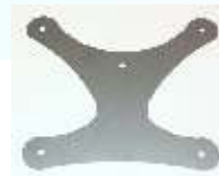
X-shaped reinforcement plate (installed inside top box)